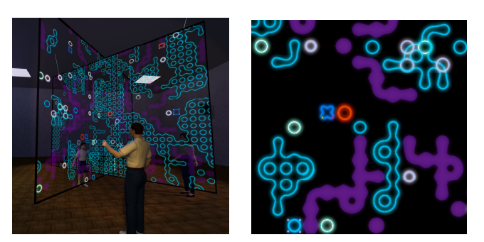
Fig. 3. McCormack: Eden (2001). Left: Interactive Installation. Right: detail [7]

Before delving into the application of the evolutionary process to art-making, it is worth remarking that any process may be harnessed for electronic generative art: from the repetitive cycle of a square wave to the population explosion of an email-spread virus. Its characteristics may reflect those listed above, or they may not. This is entirely up to the artist. This paper does not presume to dictate desirable traits suitable for all artists, only to be outlining some areas the author thinks worthy of exploration.