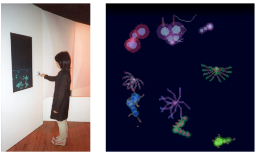
Fig. 2. Dorin: Meniscus (2003). Left: Interactive Installation. Right: detail [6]