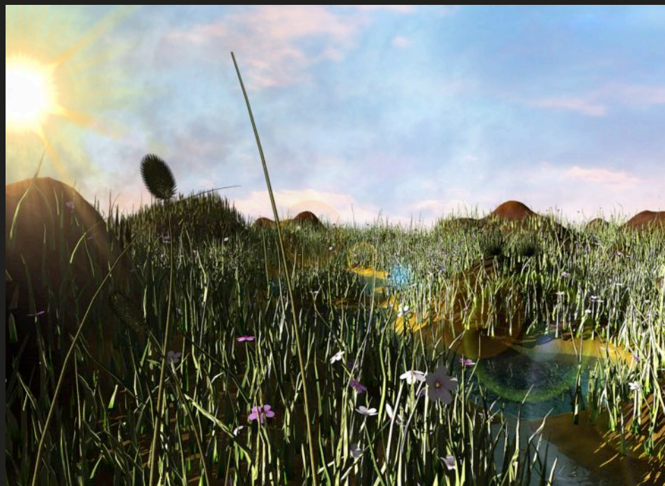
Morphogenesis series #6, 2002. lightjet print on archival paper, edition 1/10; 206cm x 150cm