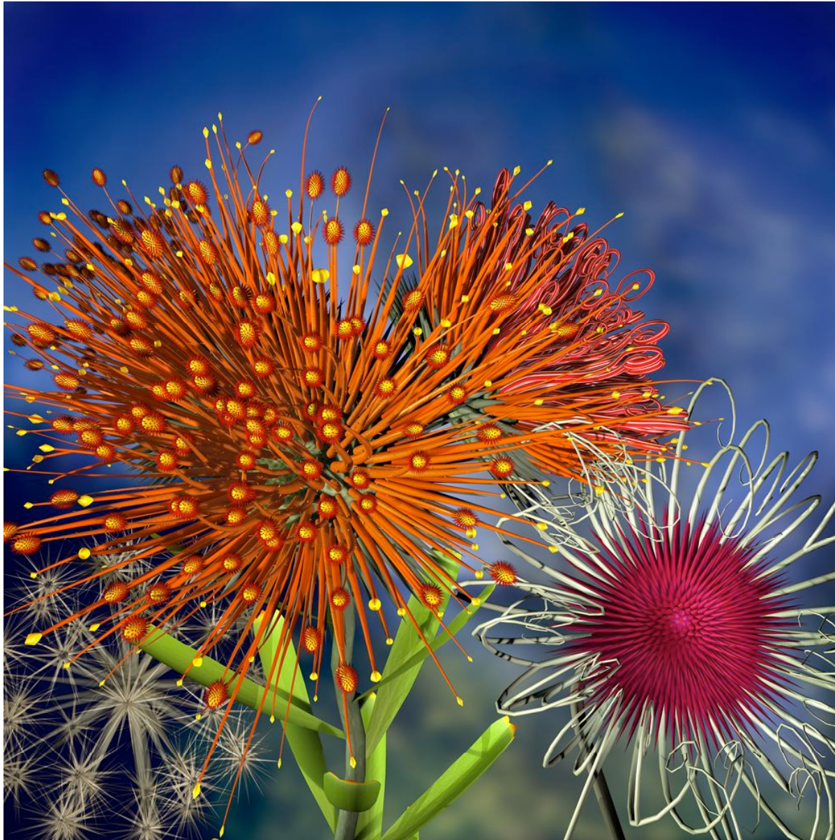
Morphogenesis series #1, 2001. lightjet print on archival paper, edition 1/6; 150cm x 150cm