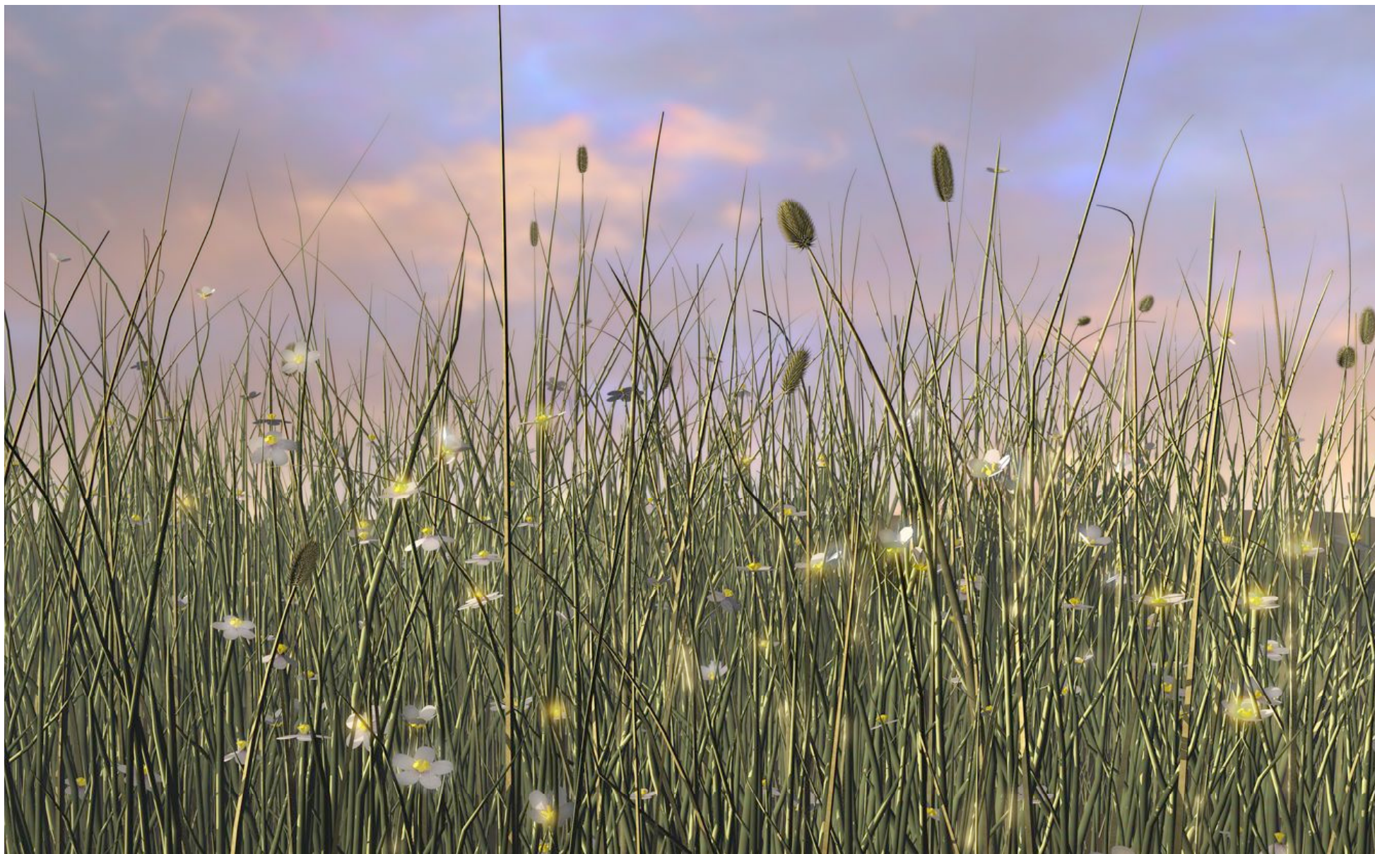
Morphogenesis series #4, 2002. lightjet print on archival paper, edition 1/10; 245cm x 150cm