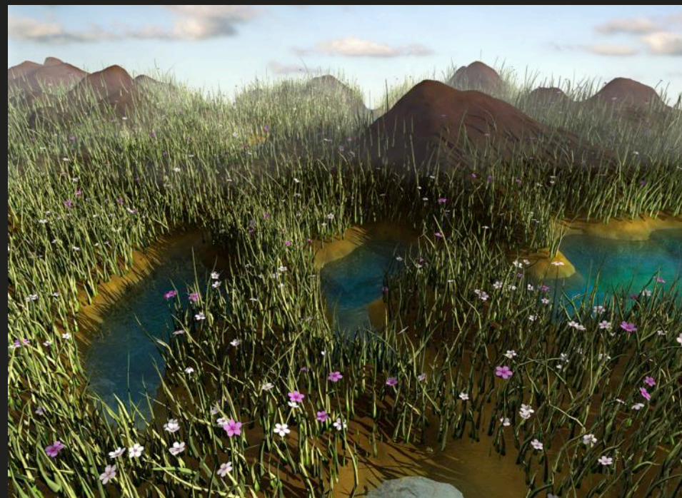
Morphogenesis series #7, 2002. lightjet print on archival paper, edition 1/10; 206cm x 150cm