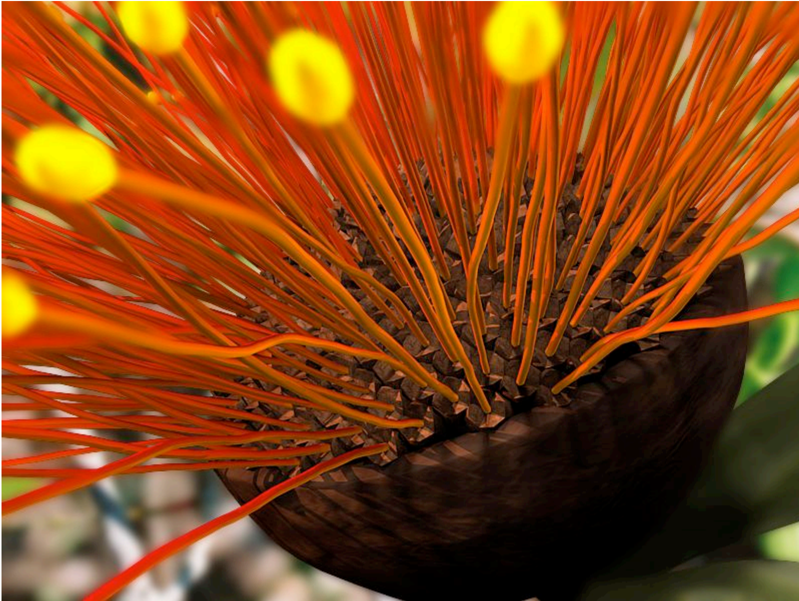
Morphogenesis series #2, 2002. lightjet print on archival paper, edition 1/10; 206cm x 150cm