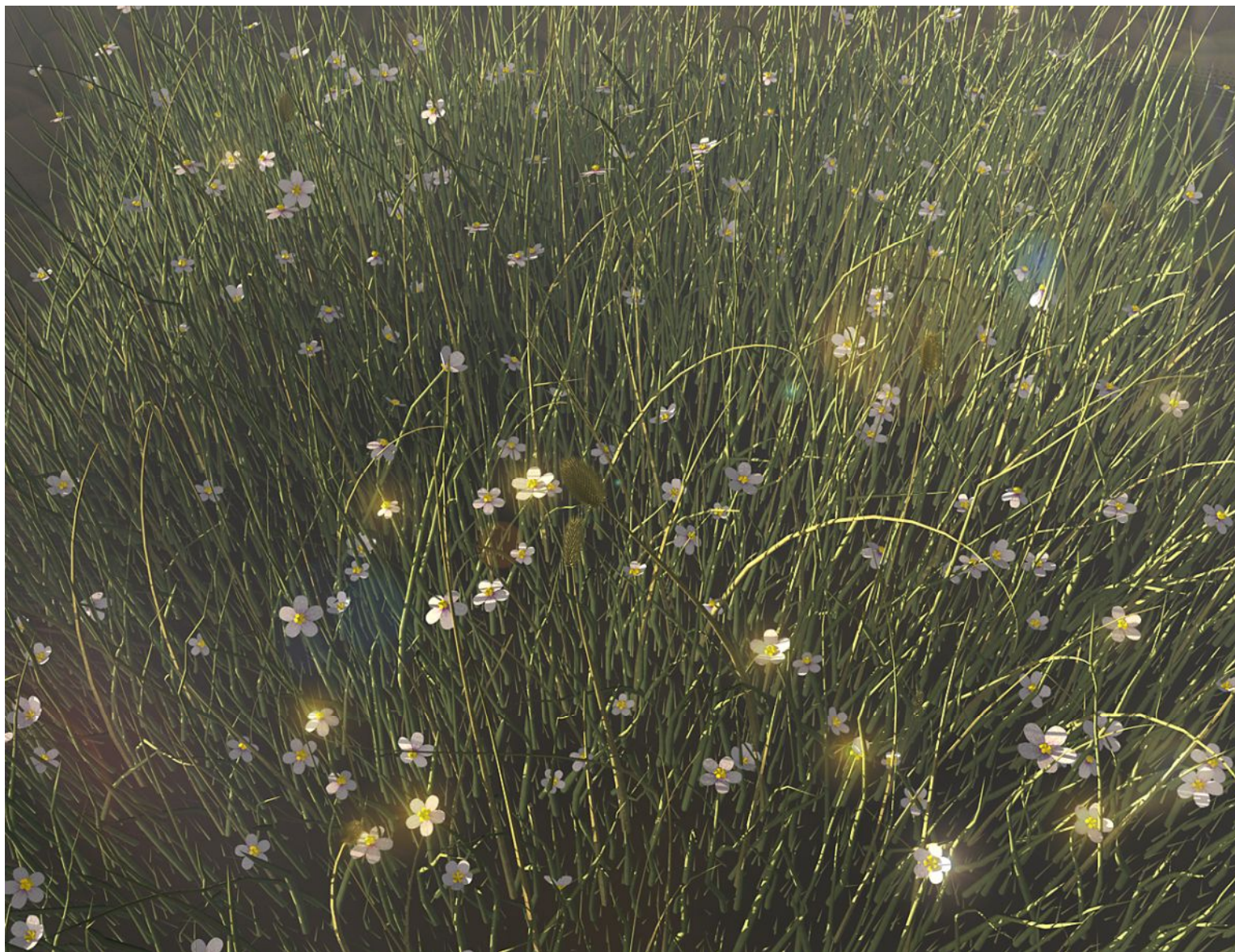
Morphogenesis series #5, 2002. lightjet print on archival paper, edition 1/5; 100cm x 76cm